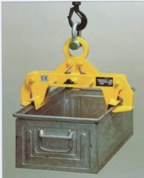
Model TKA.../...a external operating

The crate grab is available as an external or internal operating grab.