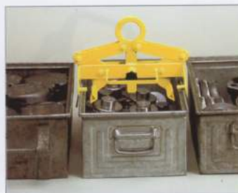
Model TKA.../...i internal operating