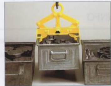
Model TKA.../...i internal operating